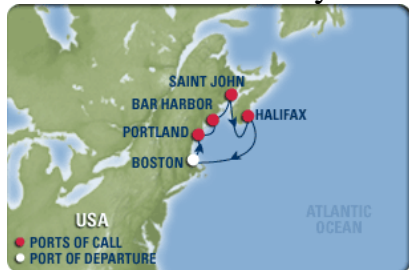
7 night Northeast

Ship Name: Jewel Of The Seas Departure Port: Boston, Mass. Return: Boston Ports of Call: Portland, Maine, Bar Harbor, St. John, NB, Halifax, NS 2012 Sail Date(s): Sept 16 - 23