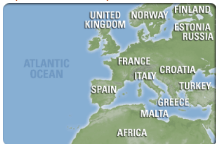
10 Night Greece & Turkey