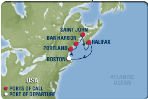
7 night Northeast

Ship Name: Jewel Of The Seas Departure Port: Boston, Mass. Return: Boston Ports of Call: Portland, Maine, Bar Harbor, St. John, NB, Halifax, NS 2012 Sail Date(s): Sept 16 - 23